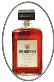
Amaretto Di Saronno